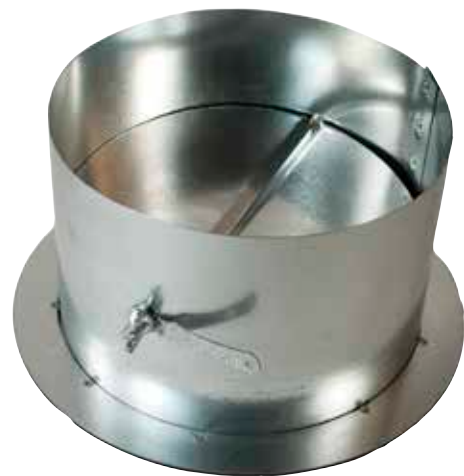
2001 Series - With Damper