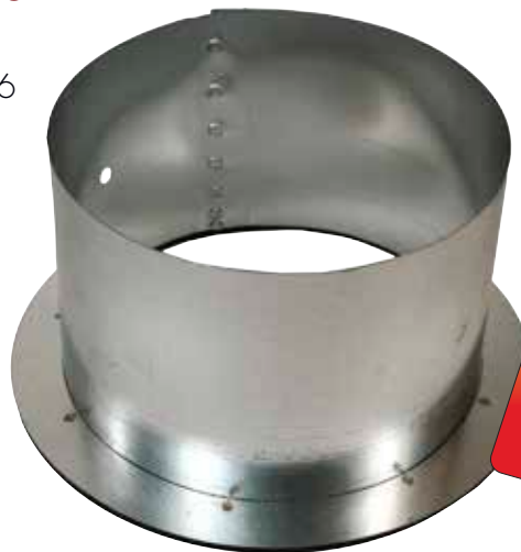
2000 Series - No Damper

24 ga, 22 ga, or 20 ga, aluminum or stainless steel.